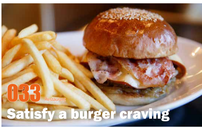
033 Restaurant Satisfy a burger craving Try the signature Golden Brown Burger, a 100% beef patty with fresh mushrooms, sautéed onions, bacon and smoked cheese, served on a soft, light bun. Golden Brown 2-B

034 Shopping Decorate with modern masters' designs Selling pieces from luxury Italian brand Cassina and multi-brand ixc, this store attracts design buffs who relish the chance to pick up works by the likes of Le Corbusier and Vico Magistretti. Cassina ixc, Aoyama Shop 2-C