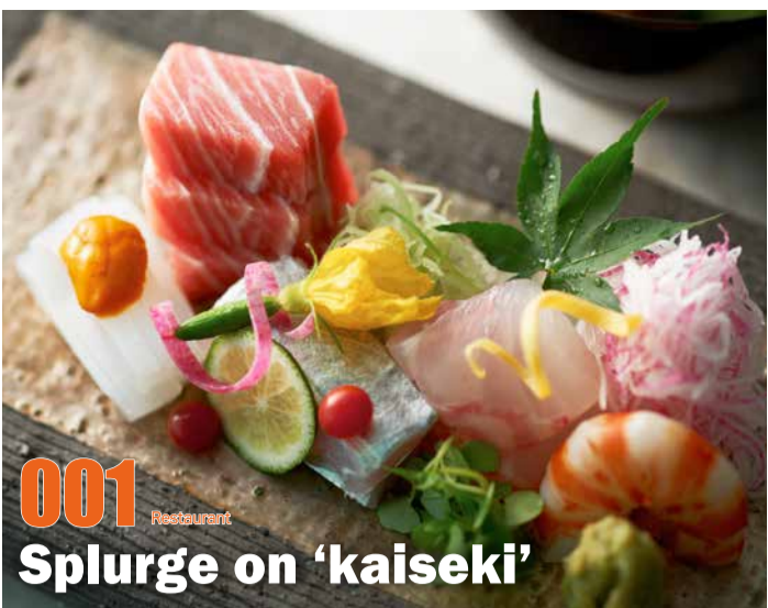
001 Restaurant Splurge on 'kaiseki' If you don't mind a ¥6,000-plus bill for lunch, Conrad Hotel's Japanese restaurant will wow you with its beautifully presented 'kaiseki' (traditional multicourse meal). The view of Hamarikyu Gardens and Tokyo Bay is pretty spectacular too. Kazahana 2-D

002 Restaurant Spice things up with Chinese specialities In the quiet neighbourhood of Shirokanedai, inside the Sheraton Miyako Hotel Tokyo, you'll find this tranquil restaurant overlooking a lush Japanese garden and serving rich Sichuan cuisine. The specialty, mabo tofu, is a spicy dish consisting of braised tofu with minced meat, chilli beans and Chinese peppers. Shisen Chinese Restaurant 3-C