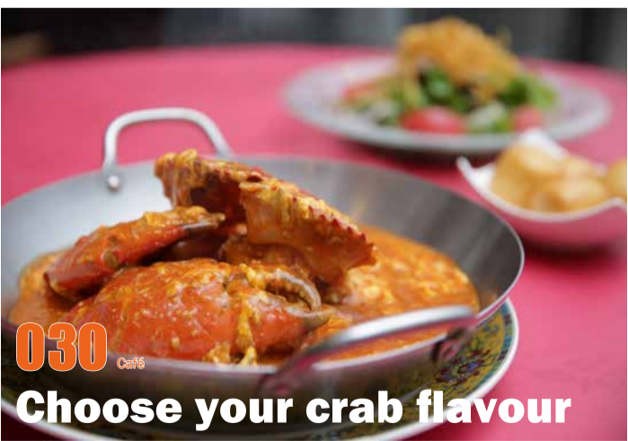
030 Café Choose your crab flavour Set inside a pretty white-washed building, this Singaporean seafood restaurant is revered for its mud crab dishes, particularly the Chilli Crab and Black Pepper Crab. Singapore Seafood Republic 4-C

029 Shopping Let's get arty Specialising in art supplies, this store stocks paints, brushes, frames and more. The brand has 12 outlets but the Shinjuku flagship boasts the best selection – all reasonably priced too. Sekaido 1-B