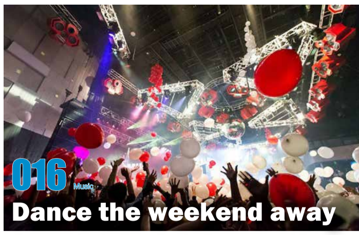
016 Music Dance the weekend away One of the biggest club in Japan, Ageha is a little out of the way, but there's a free shuttle from Shibuya every half hour and three heating dancefloors to greet you. Ageha 4-B

5 TIPS FROM THE LEXUS OWNER'S DESK No.2 Find your nearest parking lot It's always a hassle to find parking, never mind trying to find an open bay in the centre of Tokyo! Say goodbye to the stress by giving the Lexus Owner's Desk a call and letting them direct you to parking that's closest to you. Service only available for Lexus owners