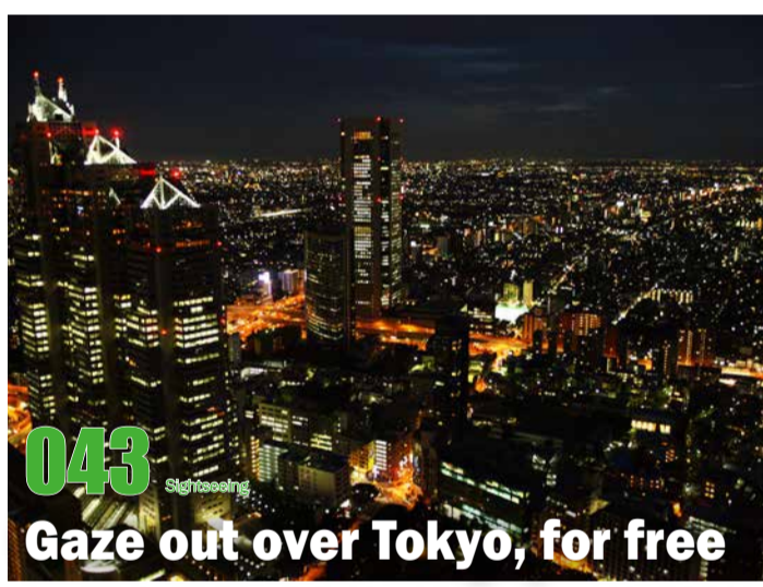
043 Sightseeing Gaze out over Tokyo, for free When you're looking to get up high but don't feel like paying for the privilege, head to the Tokyo Metropolitan Government Building's two free 45th-floor observatories, which provide beautiful sunset views and the chance to spot Mt Fuji. Tokyo Metropolitan Government Building Observatories 1-B

020 Restaurant Work your way through a Thai buffet Choose from more than 20 kinds of Thai dishes including curries, noodles and desserts at the ¥1,850 weekend buffet. A Thai chef ensures the food stays authentic. Jim Thompson's Table Thailand 2-D